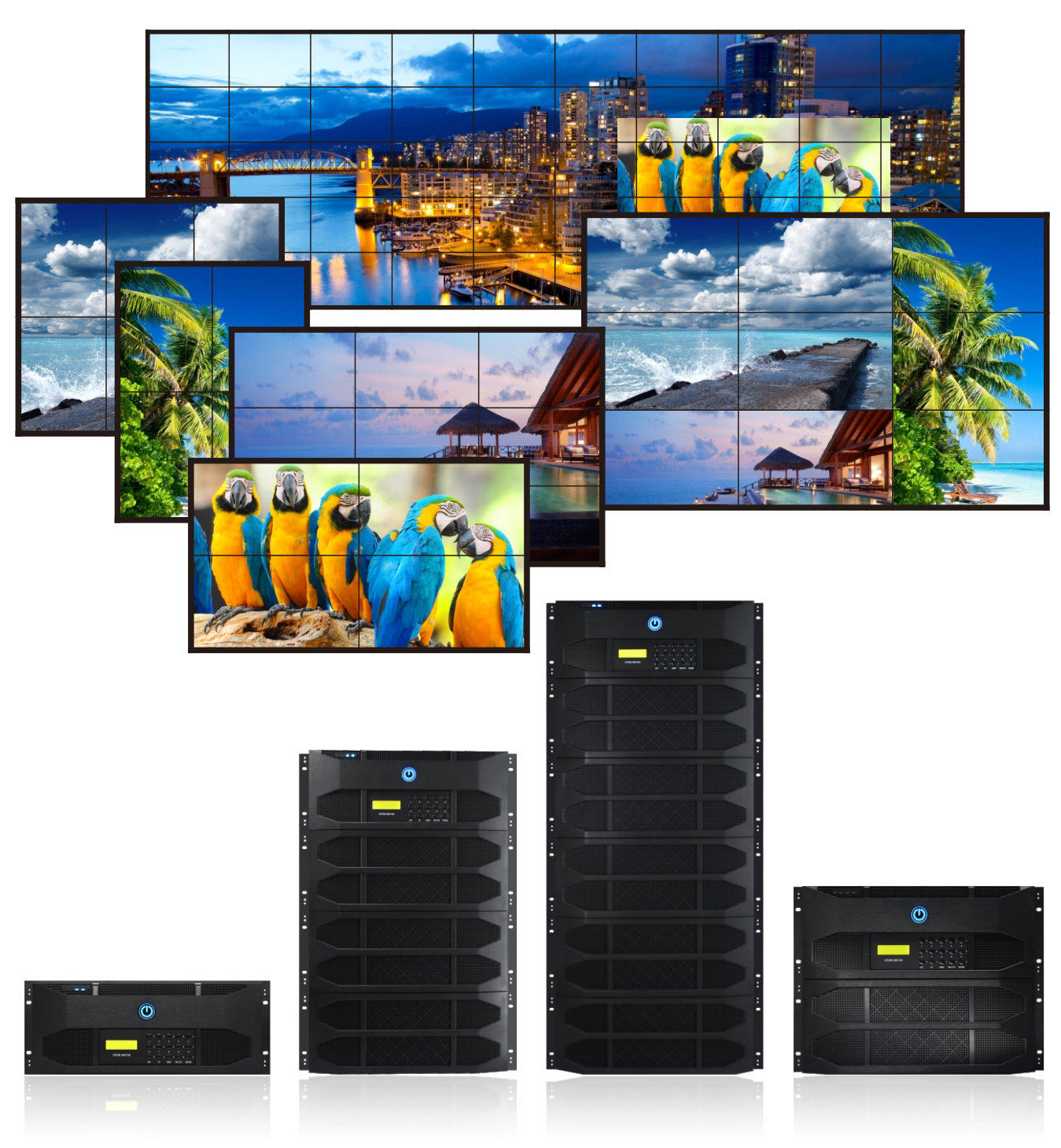
Beijing Lema Technology Co.,Ltd. www.isemc.com

Powerful Video and Image Processing Device